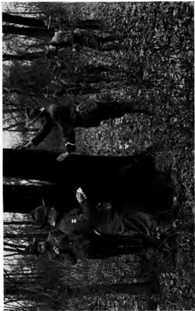
BOY SCOUTS STUDYING THE TREES